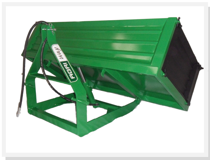
RP-RM with option hydraulic tipping Serie RP-RM avec option vérin hydraulique Serie RP-RM con accessorio martinetto di ribaltamento